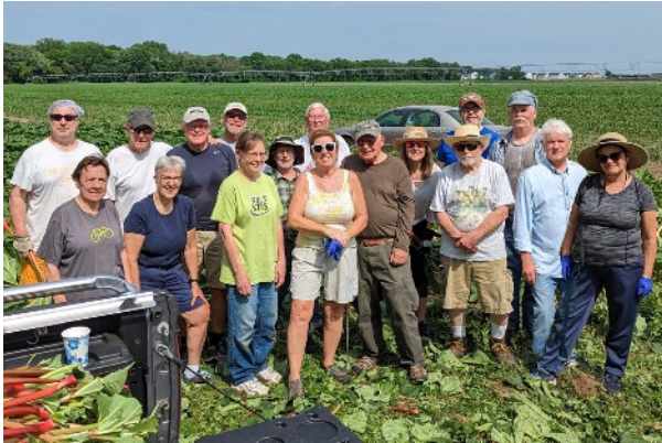
Thanks to these loyal rhubarb pullers!

We served over 200 guests a sample plate of three rhubarb desserts, prepared by Keys on Lexington Avenue, sold 115 bags of rhubarb stalks (3# for $5), 34 rhubarb plants ($10), $243 in rhubarb jam sales (thanks, Mary Burg), many Rhubarb Cookbooks, plus donations. This is always our most successful fundraiser of the year, and we thank you for your continuing support.