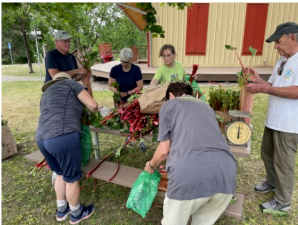
Crew bagging up the rhubarb Saturday afternoon.